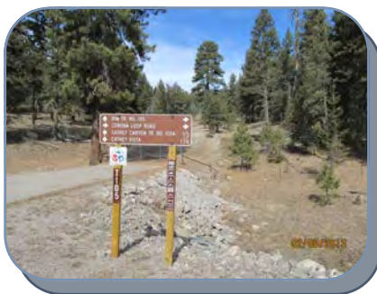
Trailhead at the Sunspot North site.

Area Attractions: (above) A few of the popular sites to visit along the Sunspot Highway. All mileposts in the table are measured from the beginning of NM6563, the Sunspot Hwy.