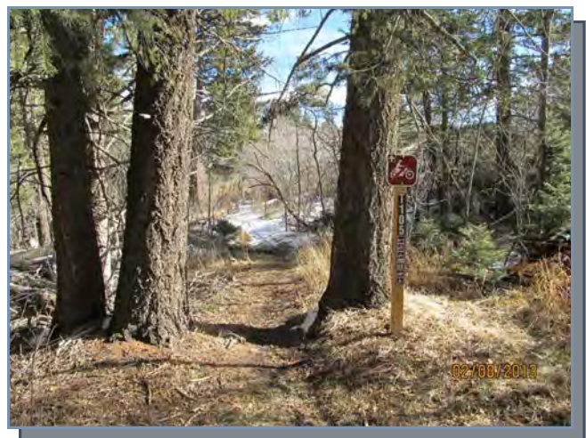
The non-motorized section of the trail between Slide Campground and Cloudcroft.

No facilities are available along the trail so come prepared with water and extra warm clothing. As always, be sure to PACK OUT WHAT YOU PACK IN to leave your public lands better than found them.