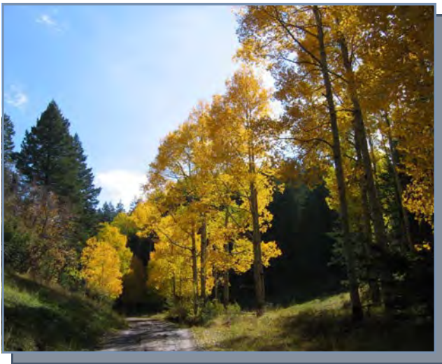
Beautiful aspens along the trail (in Karr Canyon).

From Cloudcroft, take NM130 south 0.8 miles. Turn left onto FR24B where you will find the first trailhead. This section of trail is non-mechanized. For other access points, continue 1.1 miles further and turn right onto NM6565 (Sunspot Hwy). From there you will find numerous access points (please see the map).