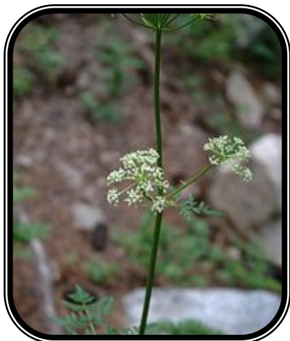
The Osha plant with its delicate white flowers

There are no water sources or restrooms. Be sure to PACK OUT WHAT YOU PACK IN to leave your public lands better than found them.